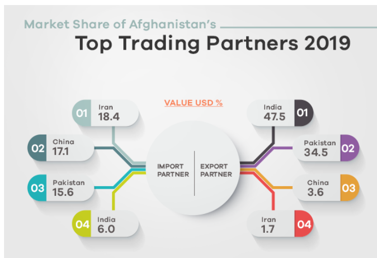
Figure 1. Afghanistan's trading partner

Before being overrun by the Taliban, the largest trading partners were India, Iran, China and Pakistan, Figure 1 shows information on the value of Afghan exports and imports to and from the four countries.