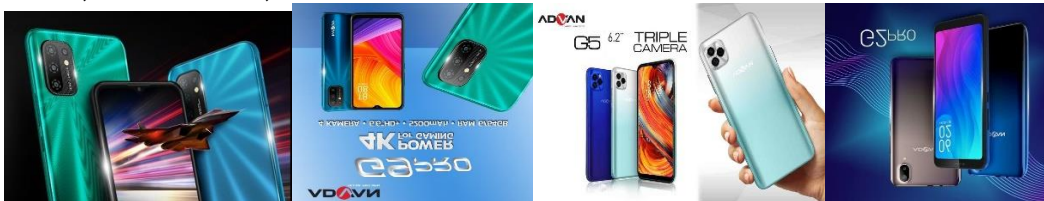
Figure.1. SMARTPHONE ADVAN

ADVAN is indeed quite famous for releasing various electronic devices, such as cellphones, tablets, headsets, and smartwatches. Advan was founded in 2007 in Jakarta and focuses on producing electronic goods. Advan itself stands under the auspices of PT Bangga Teknologi Indonesia. The thing that people may remember from the Advan brand is that the goods are very affordable coupled with fairly reliable specifications. Popular Hp products from Advan include Advan G9 Pro, Advan NASA, Advan G5, Advan Tab 8, and Advan Sketsa.