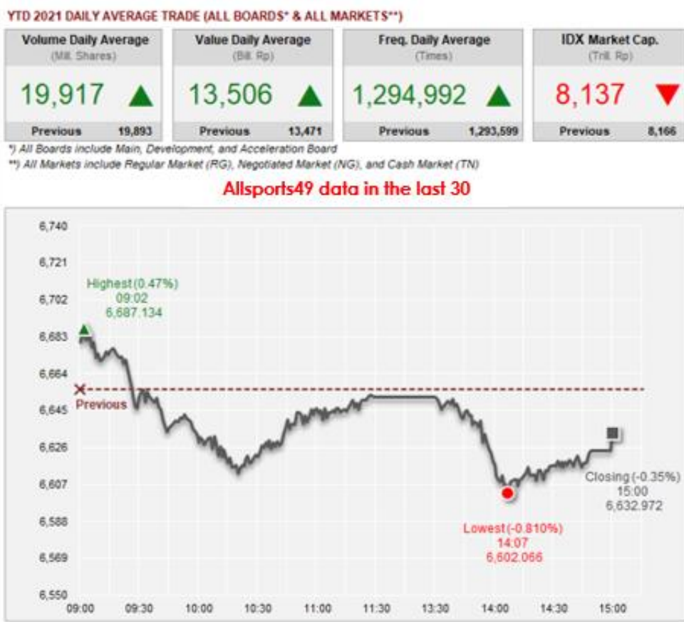
Figure 3. Data for Allsports49 Last 30 Days

The data obtained is Allsports49 data in the last 30 days obtained from the owner's records, then presented on a tube graph as follows: